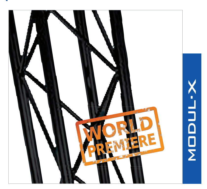
Digital Printing & Displays by www.pixis.be

Modular display solutions for shop in shop, exhibitions, events etc.